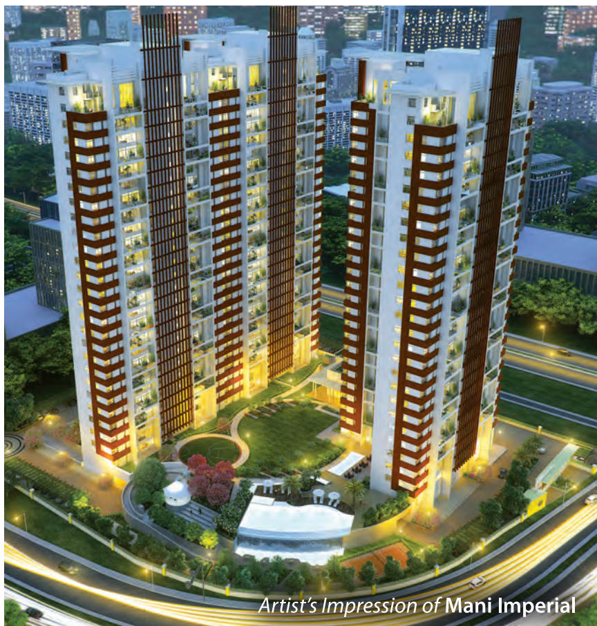
Artist's Impression of Mani Imperial