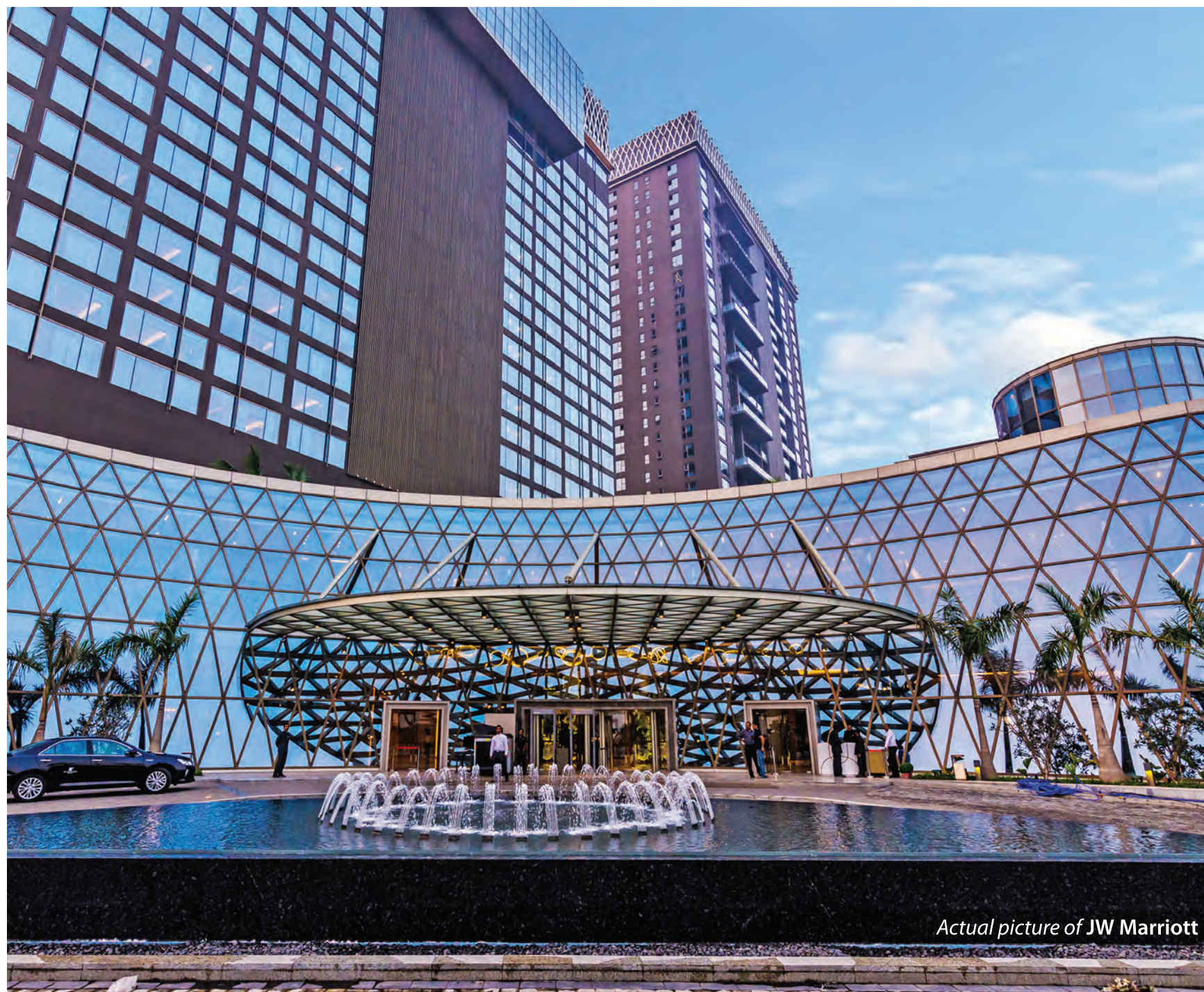
Actual picture of JW Marriott

The 795-bedded Teaching Hospital is managed by the Dr Devi Shetty run Narayana Hrudayalaya and it treats 3,000 patients everyday at unimaginably affordable rates. Its operational super-speciality departments include Cardiology, Urology, Gastro-enterology, Neurosurgery, Plastic Surgery along with 22 other departments. It boasts updated Cath labs, best ICU facilities with PICU and NICU, and a Dialysis unit.