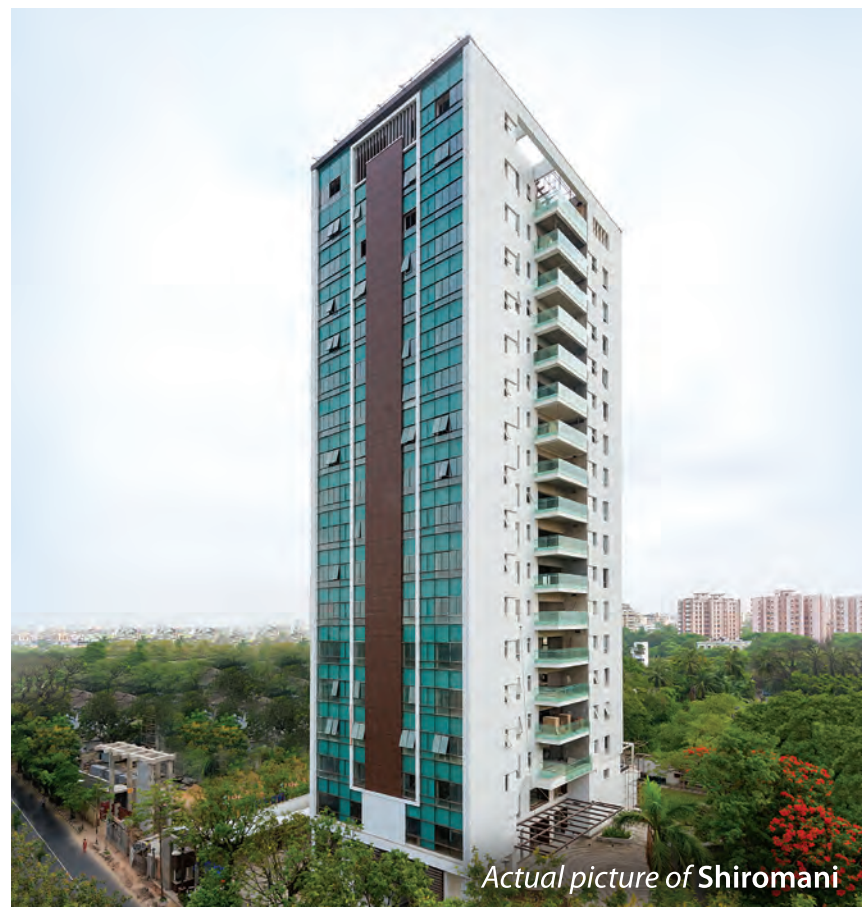
Actual picture of Shiromani