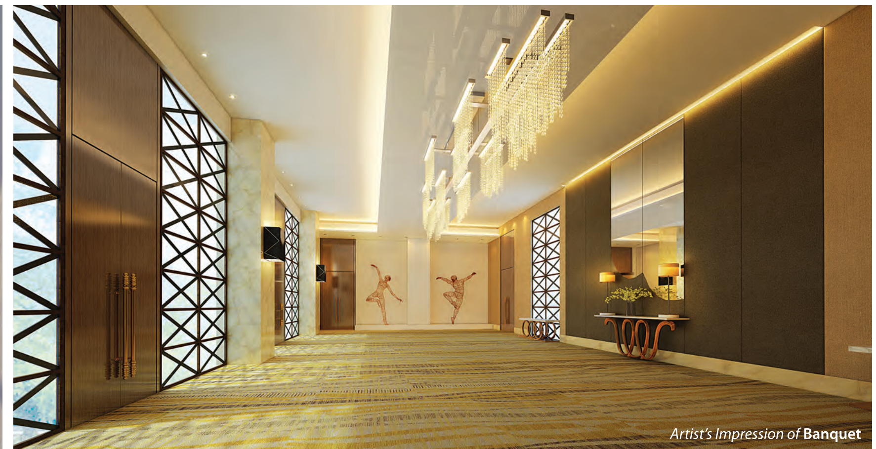
Artist's Impression of Banquet