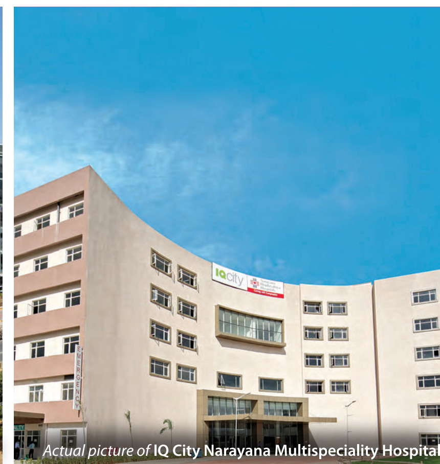
Actual picture of IQ City Narayana Multispeciality Hospital