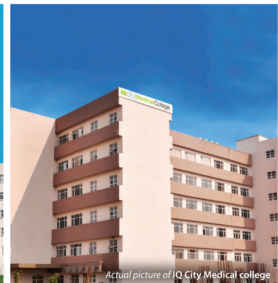
Actual picture of IQ City Medical college