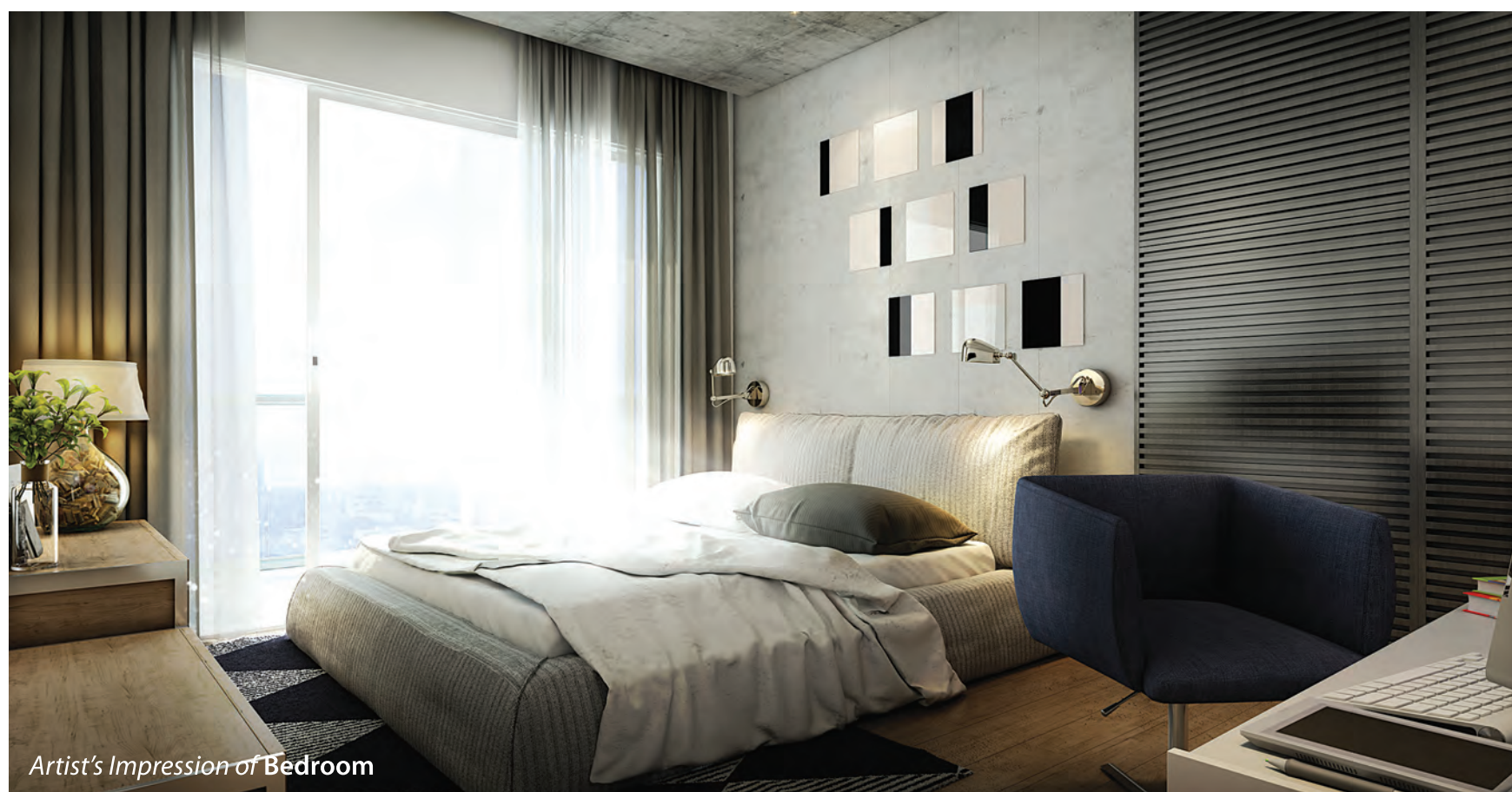
Artist's Impression of Bedroom