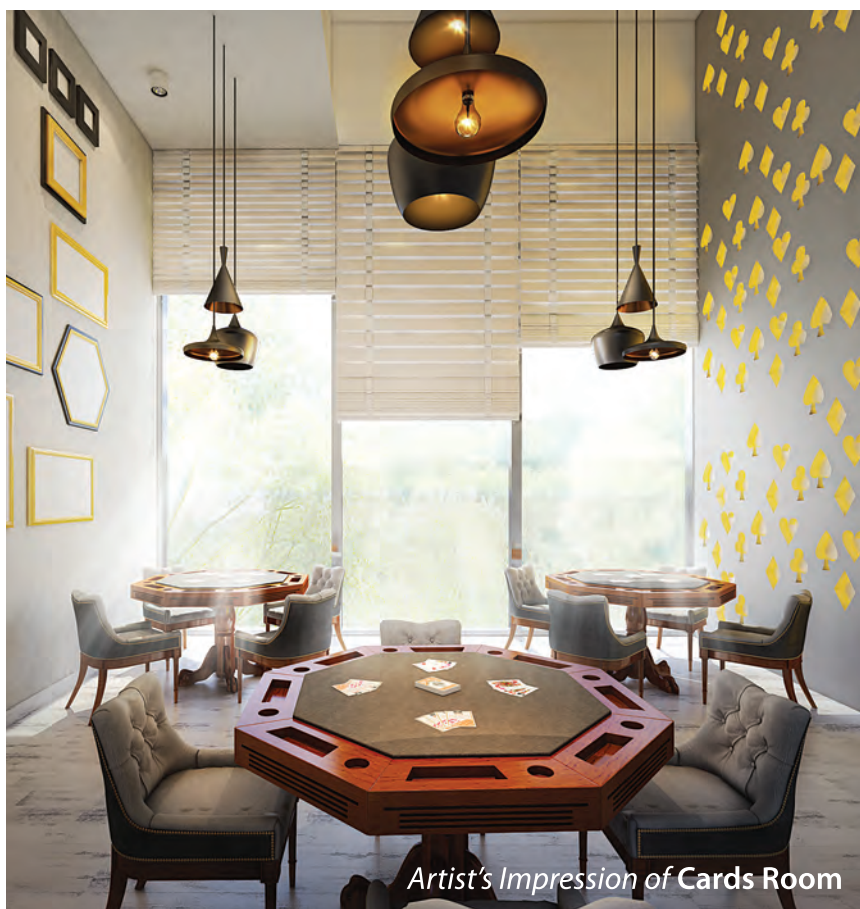
Artist's Impression of Cards Room