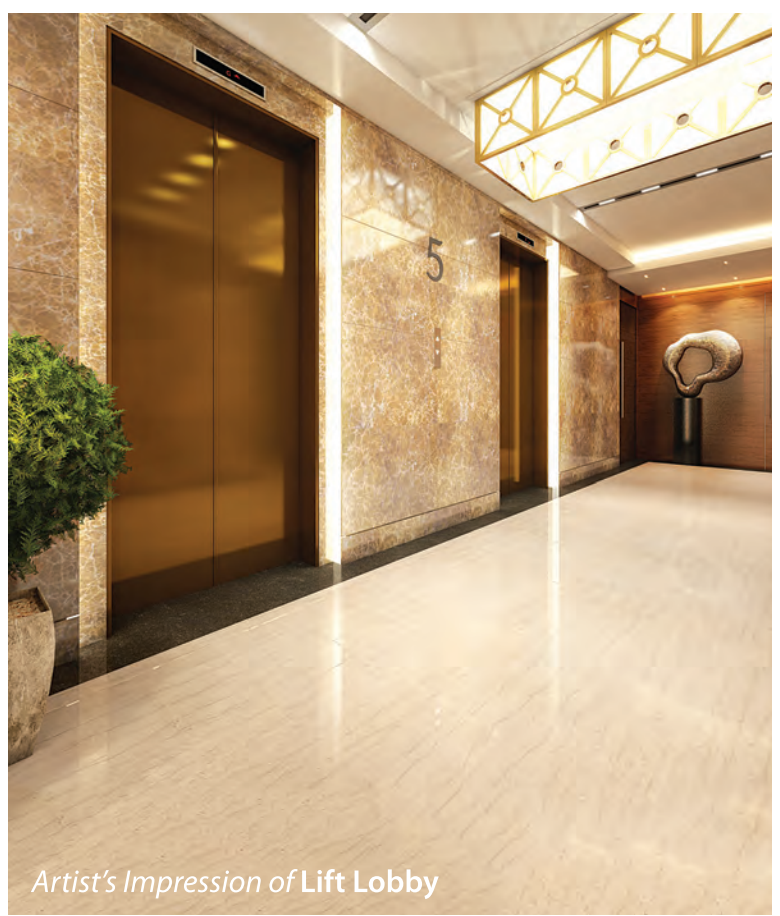
Artist's Impression of Lift Lobby