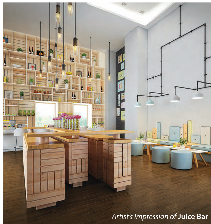
Artist's Impression of Juice Bar