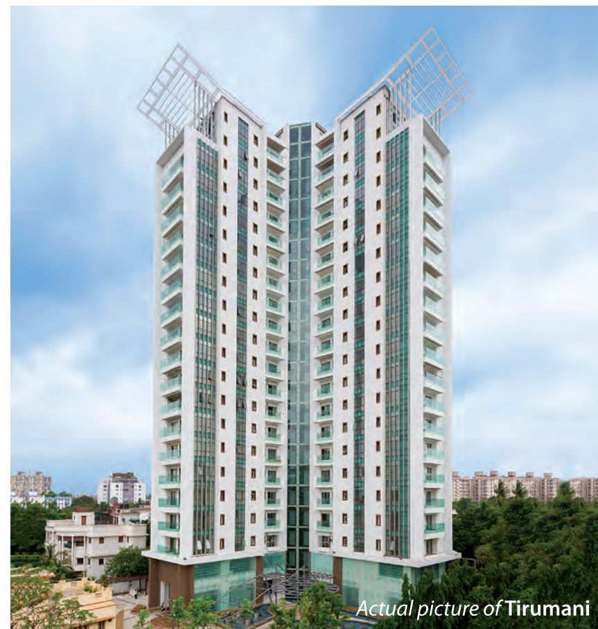
Actual picture of Tirumani