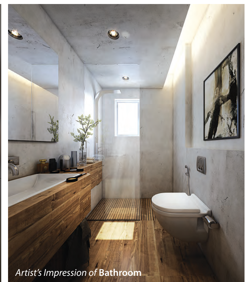
Artist's Impression of Bathroom