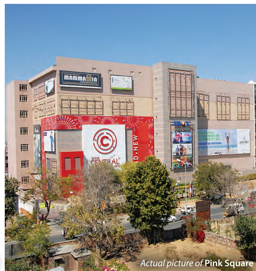
Actual picture of Pink Square