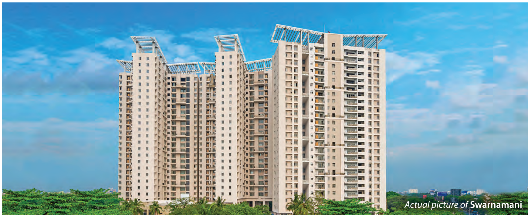
Actual picture of Swarnamani