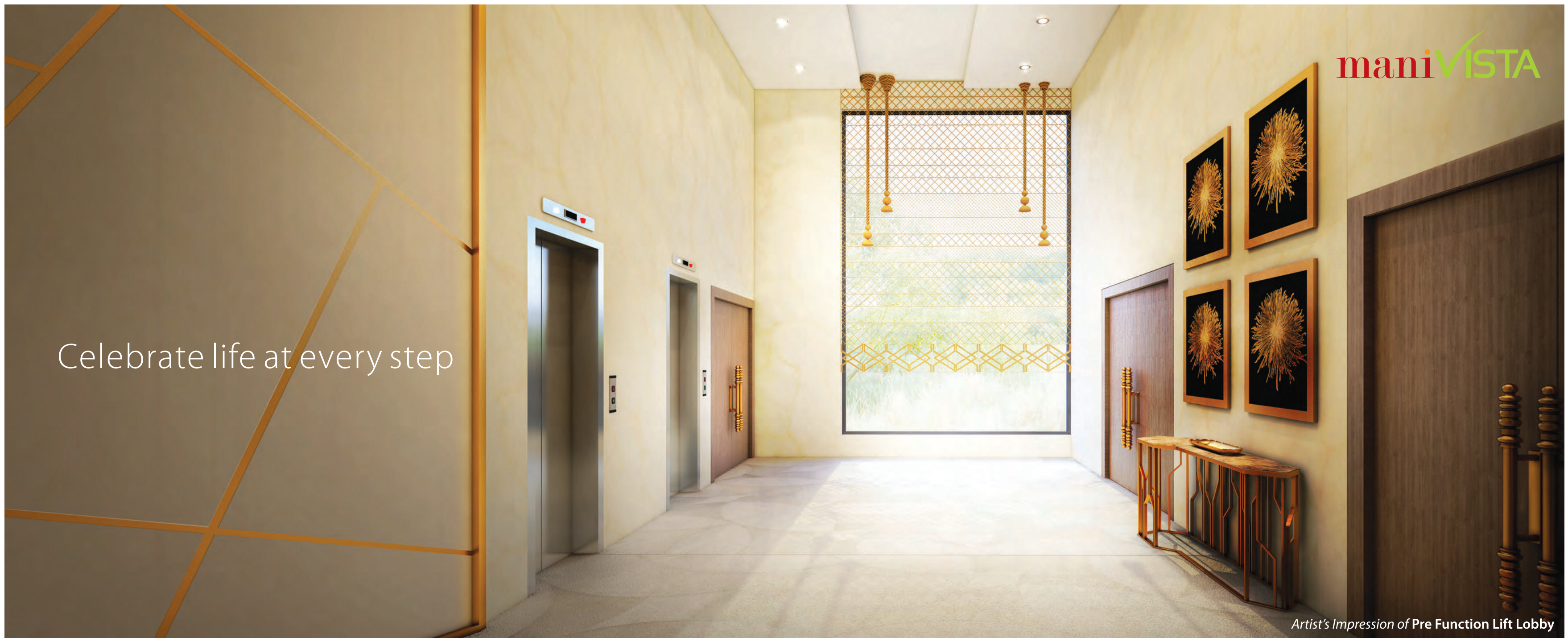
Artist's Impression of Pre Function Lift Lobby