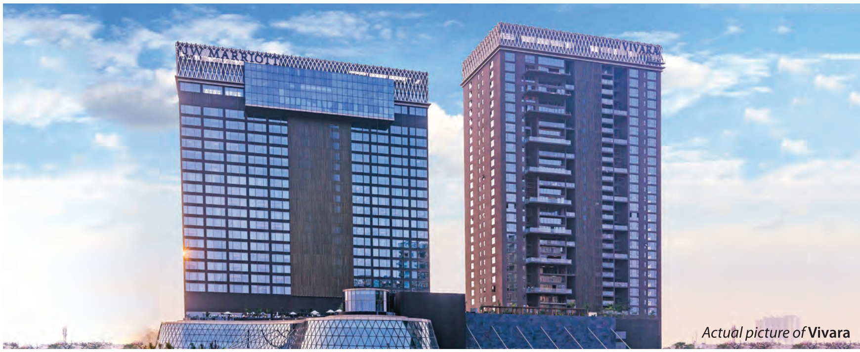
Actual picture of Vivara