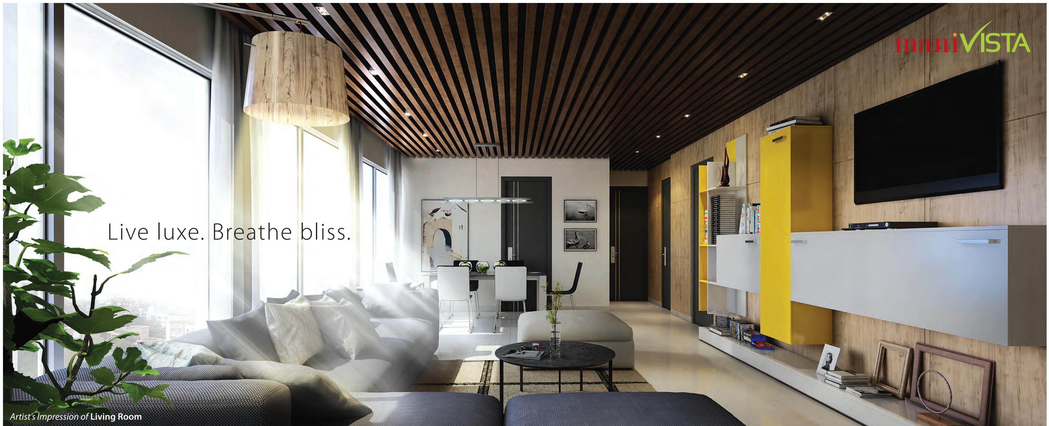
Artist's Impression of Living Room