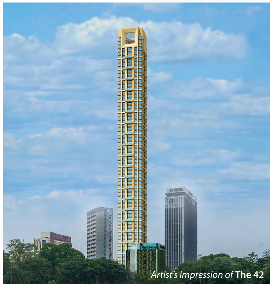
Artist's Impression of The 42