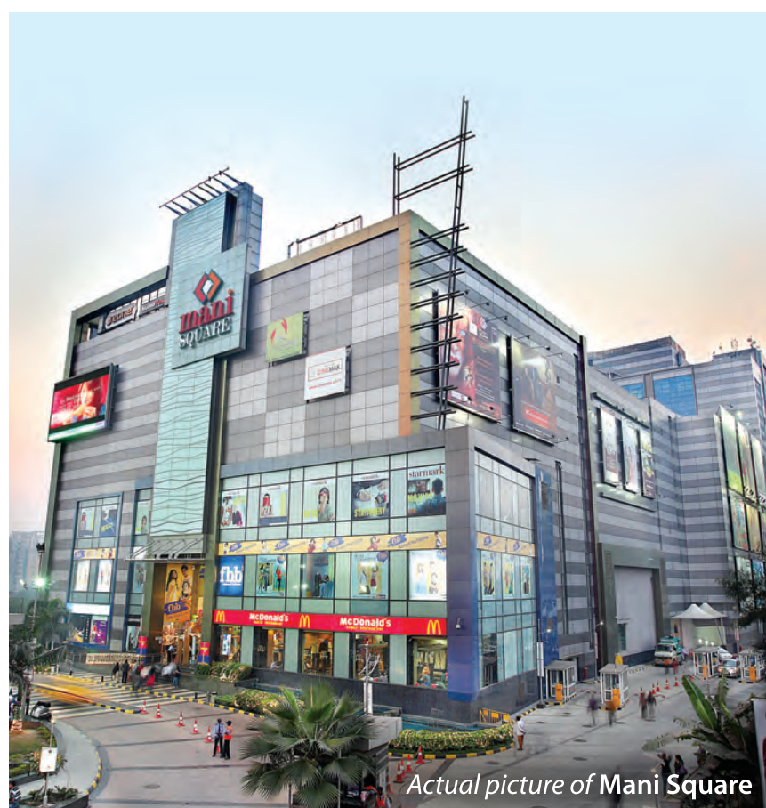
Actual picture of Mani Square