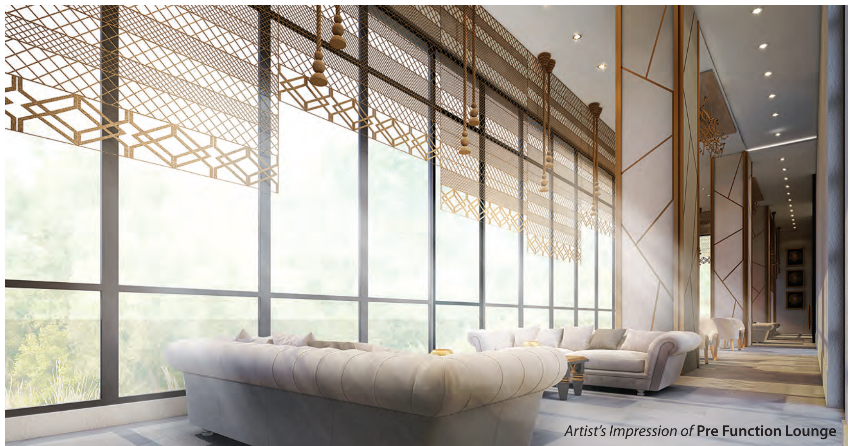
Artist's Impression of Pre Function Lounge