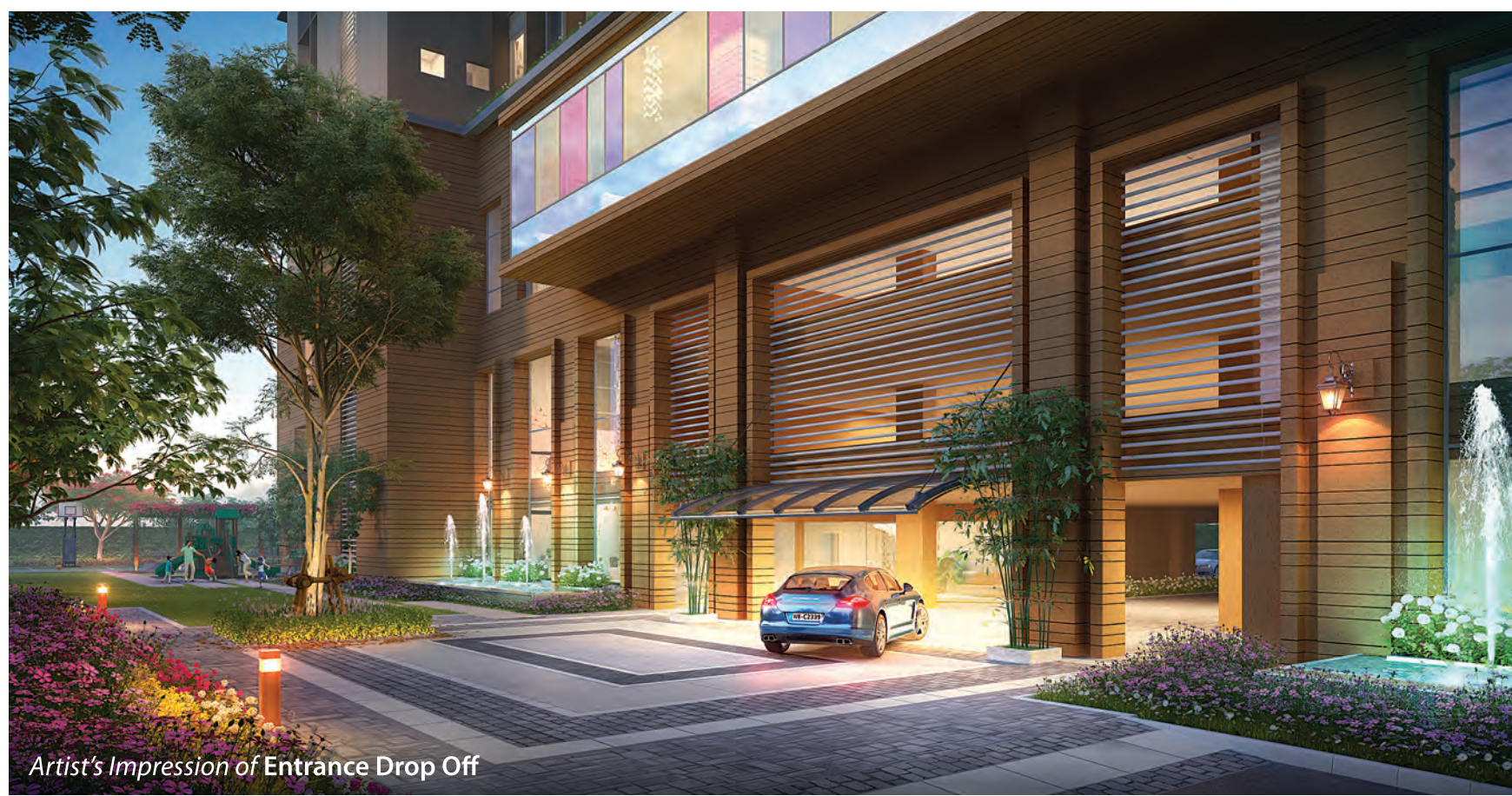
Artist's Impression of Entrance Drop Off