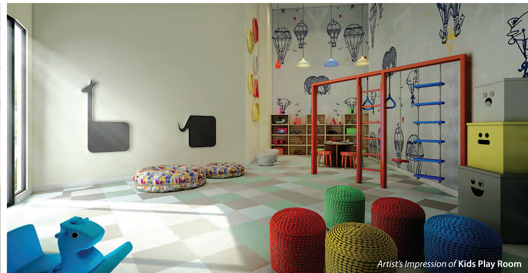
Artist's Impression of Kids Play Room