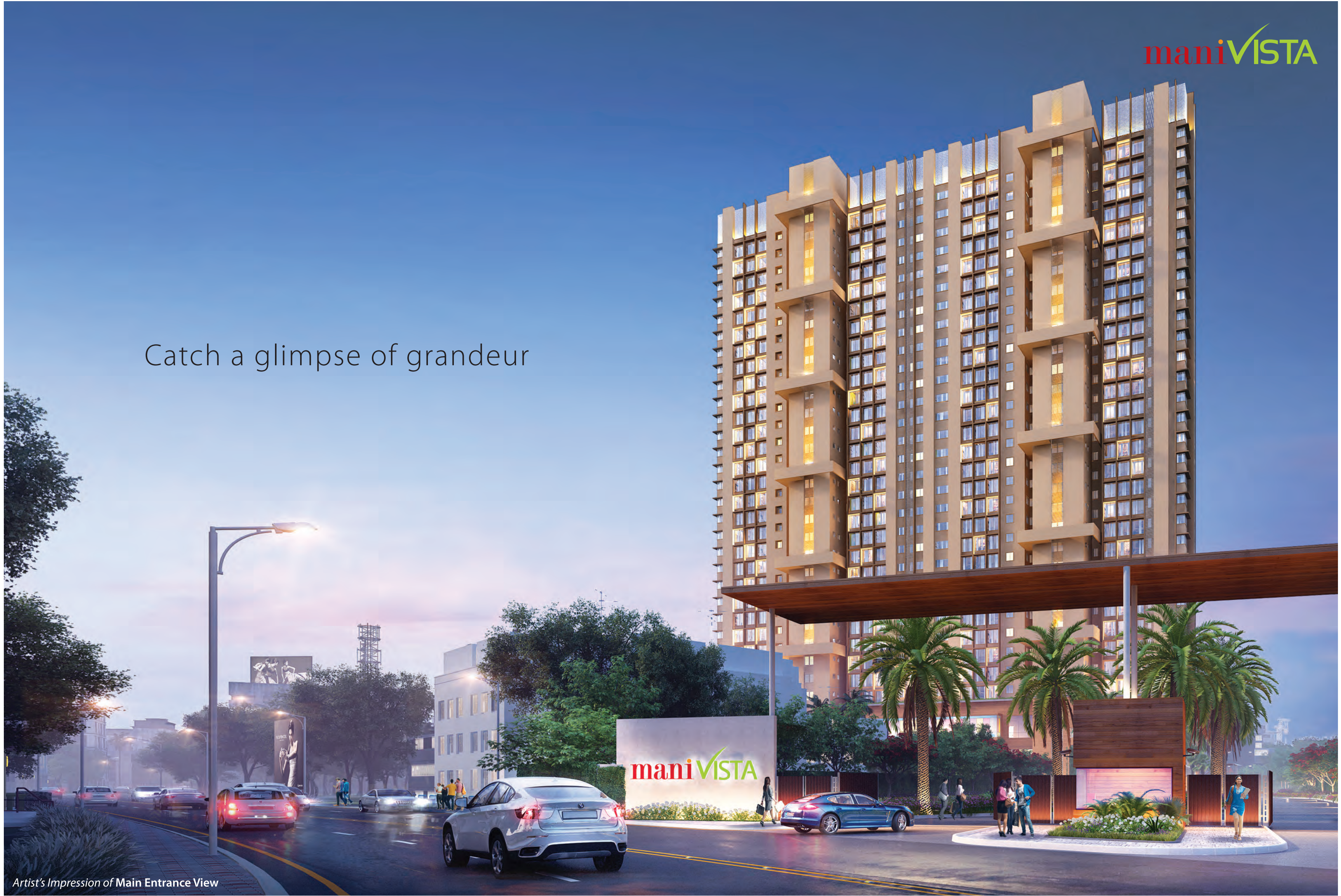
Artist's Impression of Main Entrance View