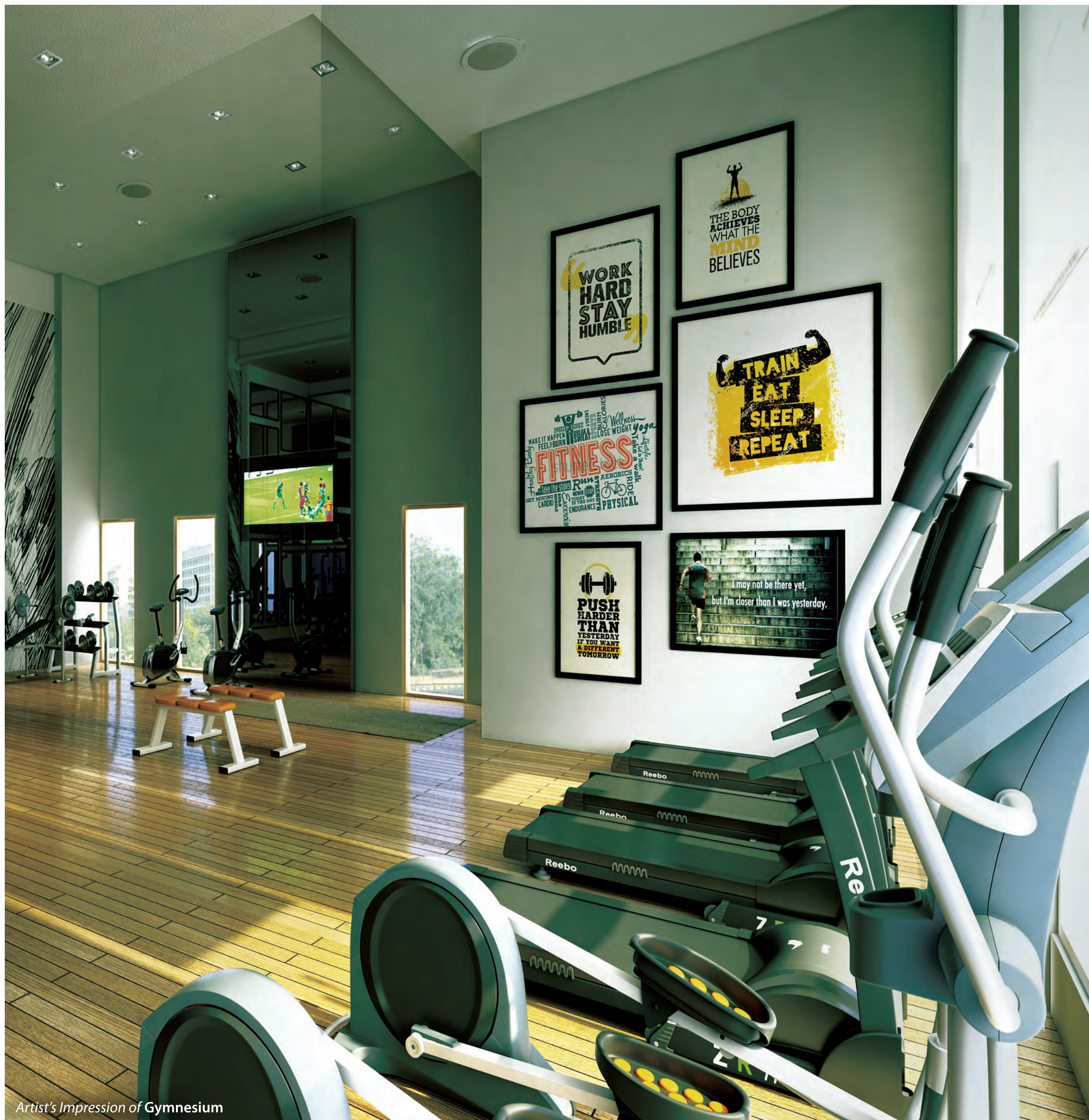
Artist's Impression of Gymnasium