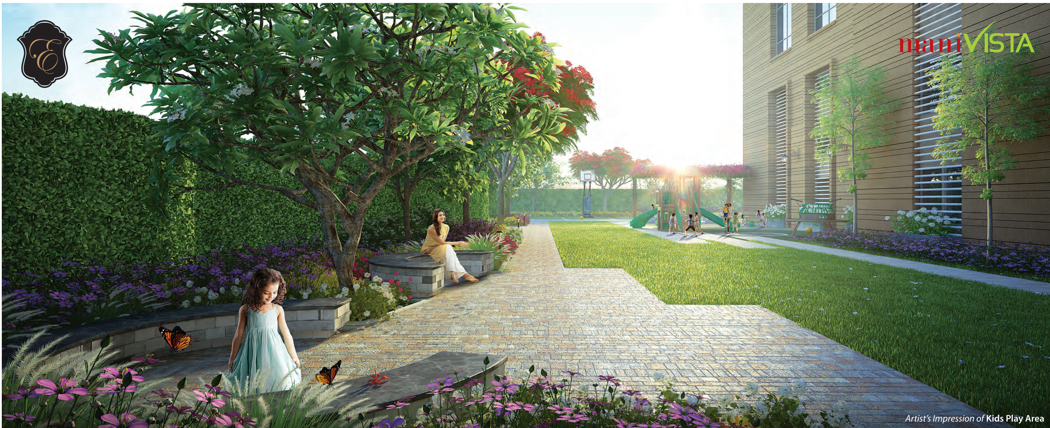
Artist's Impression of Kids Play Area