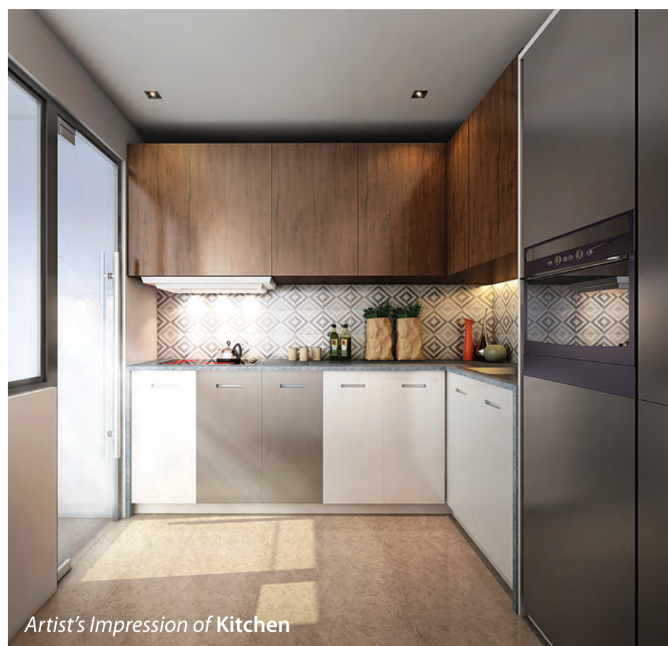
Artist's Impression of Kitchen